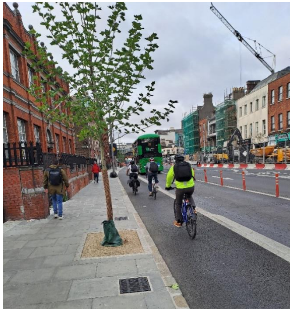
Fig 1 – Inbound Amiens Street Substantially Complete

It is hoped that the majority of the inbound side of the Scheme can be substantially completed by early October and almost all of the 2.7km of inbound cycle-track and footway opened. The new retaining wall at the CIE Headquarters building at the corner of Sheriff Street Lower is progressing well and the remaining inbound section of Amiens Street inbound right outside Connolly Station is likely to commence in early 2024.